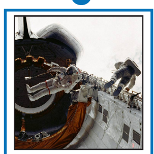
April 7, 1983: American astronauts Don Peterson and Story Musgrave took the first spacewalk outside of a space shuttle. The spacewalk mission was in support of NASA's deployment of the first tracking and data relay satellite and occurred on the maiden voyage of the space shuttle Challenger.