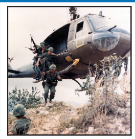
April 6-8, 1968: Units from the 1st Cavalry Division (Airmobile) ended the 77-day siege of Khe Sanh, Vietnam. On April 8, 1968, the 3rd Brigade, 1st Cavalry Division, used CH-47 Chinook and UH-1 Iroquois helicopters to airlift its brigade headquarters into Khe Sanh and assumed the mission of area security from the 26th Marine Regiment.