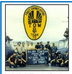
April 1972: The 1st Combat Aerial Tube-launched, Optically tracked, Wireguided Missile Team was designated and deployed to Vietnam. The team consisted of XM26 TOW sub systems mounted on UH-1B Iroquois Helicopters. The team's name of "Hawk's Claw" reflected the May 2, 1972, first-time use of the airborne TOW missile system in combat against an armored enemy during the Battle of Kontum.

The AMCOM Flight is an authorized publication for members of the U.S. Army Aviation and Missile Command. Contents are not necessarily the official views of, or endorsed by, the U.S. government or the Department of the Army. Questions, comments and story ideas may be emailed to AMCOM's Public and Congressional Affairs Office, or call 256-842-3546. Past editions of The AMCOM Flight are available on AMCOM's Command Information Portal.