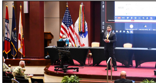
Donald Nitti, U.S. Army Aviation and Missile Command Deputy Commander, presents the unit update during the AMCOM 101 forum.

The aviation professionals received briefings and were able to discuss several key topics during the forum. The first day was filled with updates from AMCOM, Future Vertical Lift Cross Functional Team, and U.S. Army Aviation Center of Excellence... READ MORE