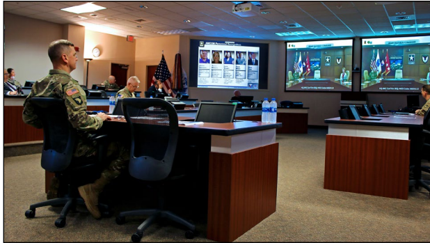
While maintaining safe social distancing, Maj. Gen. Todd Royar, AMCOM commanding general, and his staff, update AMC, June 5, on continued improvements in aviation and missile readiness.

AMCOM's briefing room was limited to those who were scheduled to present information, maintaining COVID-19 preventive measures by ensuring ample distance between seats.