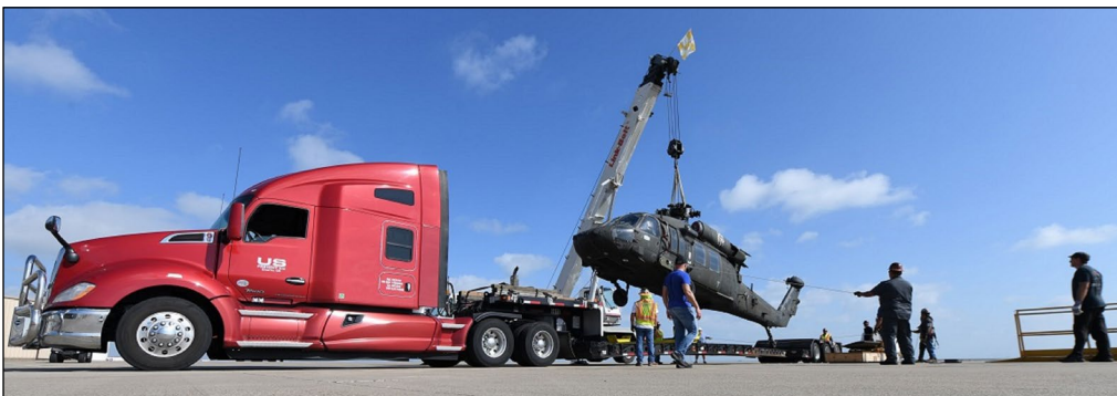
A UH-60L Black Hawk helicopter is loaded at Corpus Christi Army Depot in preparation for its trip to Wichita State University and the National Institute of Aviation Research (NIAR).

AMCOM, the Strategic Capabilities Office within the Office of the Secretary of Defense, and Wichita State University researchers at the National Institute of Aviation Research (NIAR) will create a virtual model of a UH-60L Black Hawk helicopter. Researchers will completely disassemble one of the airframes from Corpus Christi and capture a 3-D... READ MORE